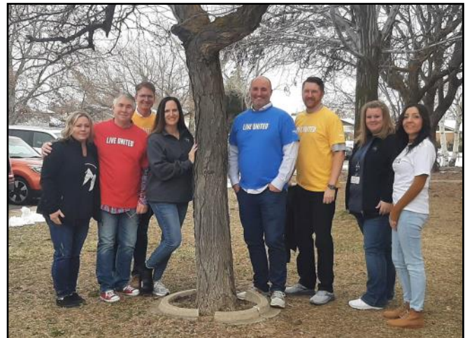
Weber Human Services employees and Foundation board members gather for a picture after finishing the service project.