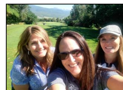
Weber School Foundation