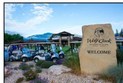
The Foundation was getting ready for another fun day at Wolf Creek!