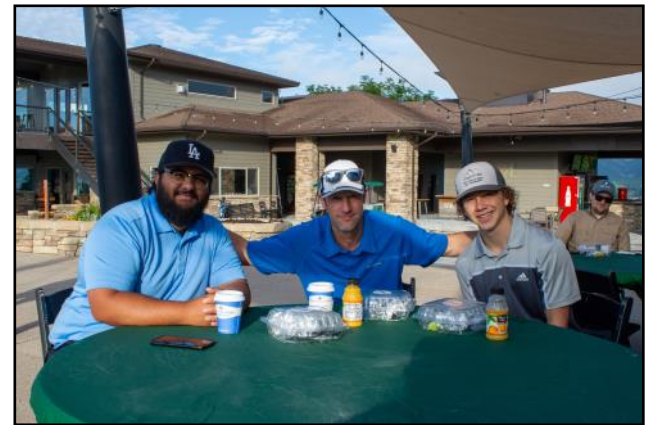
Golfers enjoy breakfast at the tournament.