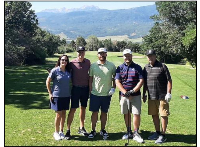
Tukios Tribute Videos