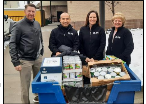
Weber Human Services employees, Foundation board members, and other community members helped to unload several bins full of food donated on April 3, 2023 to the Lantern House.