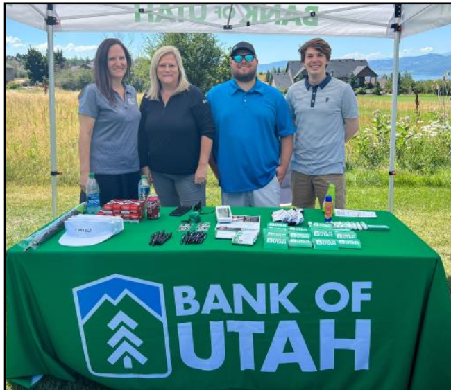
Bank of Utah - Hole in Two Sponsor