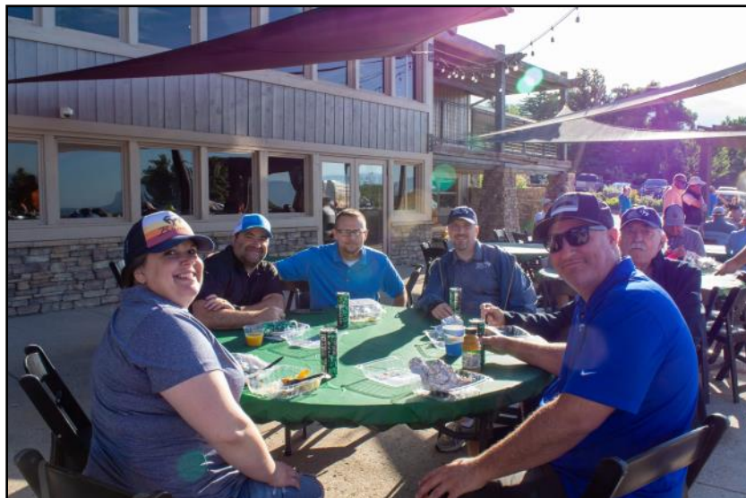
Foundation Board members and Weber Human Services administrators before the shotgun start.