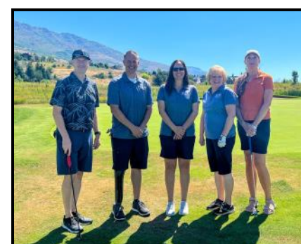
Wasatch Peaks Credit Union