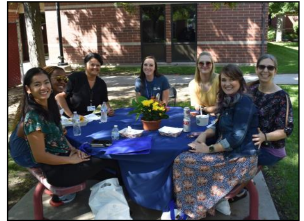
Students from Weber State University enjoy the event.

“When we celebrated our 30th anniversary, name change event, I reflected on my career at Weber Human Services. I have witnessed building and name changes of our agency during this time. The most impactful change I’ve seen, has been the progression of our treatment and services. Science and research has taught us many advancements and our staff who facilitate business processes and direct care, deliver high quality services to our clientele. I am so grateful to work amongst some of the greatest people who choose to work at Weber Human Services, including members of our community who volunteer many hours to the Foundation and our agency.”