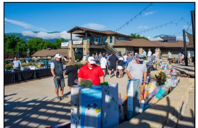
Golfers participate in the raffle before the shotgun start.