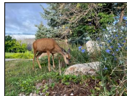
The Foundation's mascot came out to eat and make sure everyone had a good time.