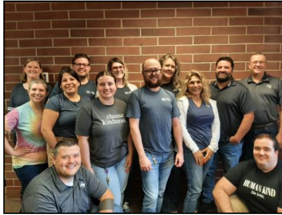
Weber Human Services Employees run the IMR and PEMFG (psychoeducational Multifamily Group)

Weber Human Services Foundation believes in celebrating client success. The Illness Management Recovery Group (IMR) has hosted four graduations in 2023 for clients who successfully completed their treatment programs. In order to graduate, clients need to attend a minimum of 42 groups. Clients and their support people are able to attend and celebrate this accomplishment. “It has helped empower clients, families, and employees as clients share how the evidence based