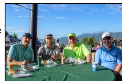
Nucor - Vulcraft