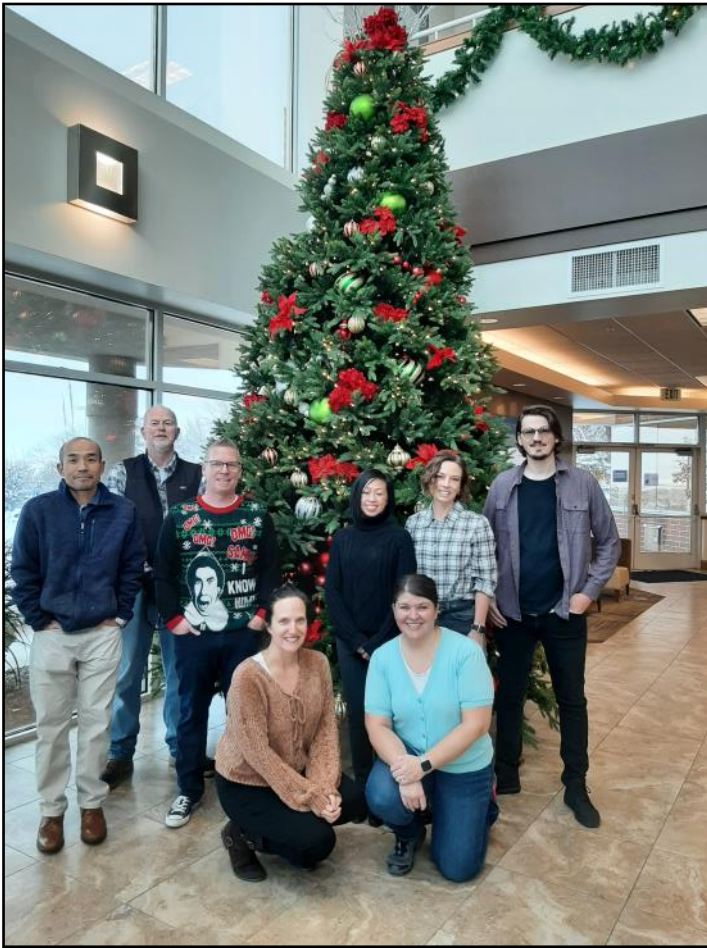
Weber Human Services staff and employees at Goldenwest Credit Union take a picture before loading up presents for more than 30 families in December 2022.