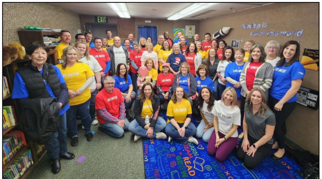
United Way of Northern Utah organized a successful event and we are grateful to be a part of their outreach in the community.