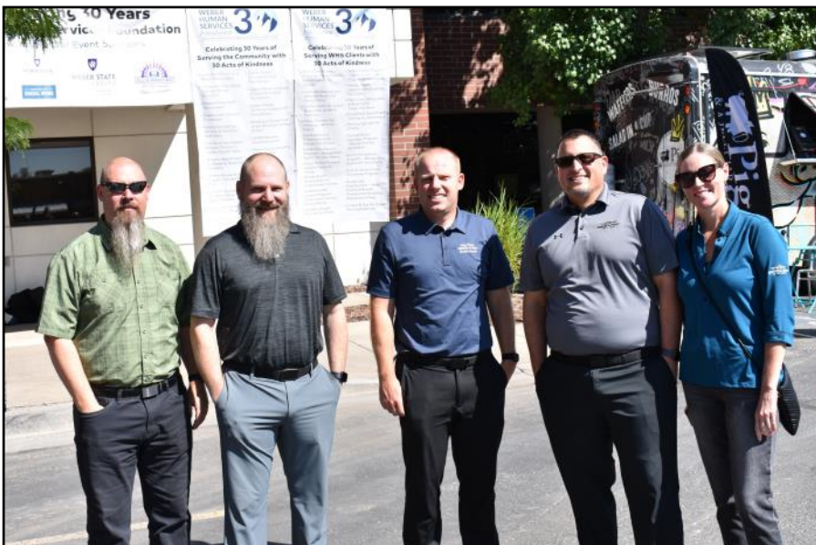
America First Credit Union employees enjoy the 30th anniversary event.