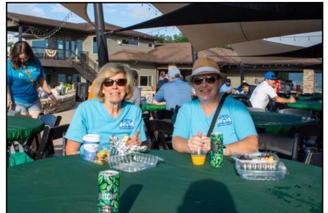
Friends of the Weber/Morgan Children's Justice Center - Hole in One Sponsor