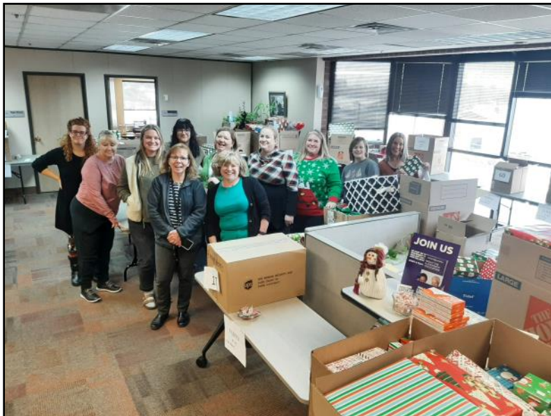
Weber Human Services Senior Services Department employees help organize presents for families during the Sub for Santa program. They are the best elves Santa could ask for!