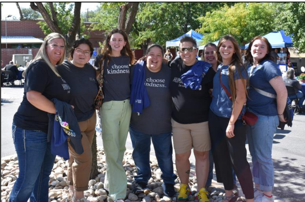
Weber Human Services employees enjoy the festivities at the 30th anniversary event.