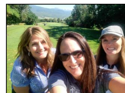
Weber School Foundation