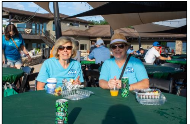
Friends of the Weber/Morgan Children's Justice Center - Hole in One Sponsor