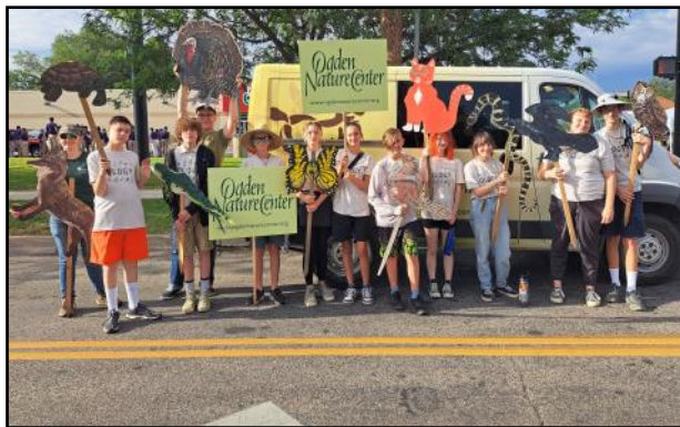
Ogden Nature Center - “Volunteens” Program