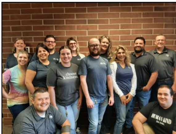
Weber Human Services Employees run the IMR and PEMFG (psychoeducational Multifamily Group)

Weber Human Services Foundation believes in celebrating client success. The Illness Management Recovery Group (IMR) has hosted four graduations in 2023 for clients who successfully completed their treatment programs. In order to graduate, clients need to attend a minimum of 42 groups. Clients and their support people are able to attend and celebrate this accomplishment. “It has helped empower clients, families, and employees as clients share how the evidence based