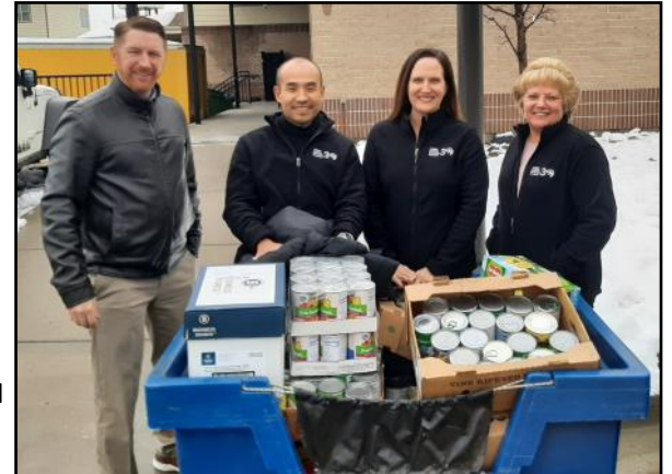
Weber Human Services employees, Foundation board members, and other community members helped to unload several bins full of food donated on April 3, 2023 to the Lantern House.