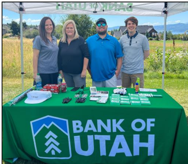
Bank of Utah - Hole in Two Sponsor