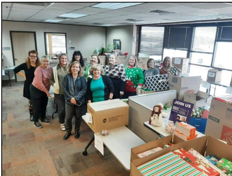
Weber Human Services Senior Services Department employees help organize presents for families during the Sub for Santa program. They are the best elves Santa could ask for!