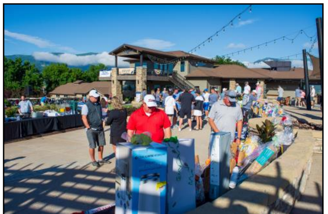
Golfers participate in the raffle before the shotgun start.