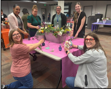
Employees at Weber Human Services enjoy making floral arrangements on Earth Day .

* Employees who donated to more than one fund within the Foundation are marked with an asterisk.