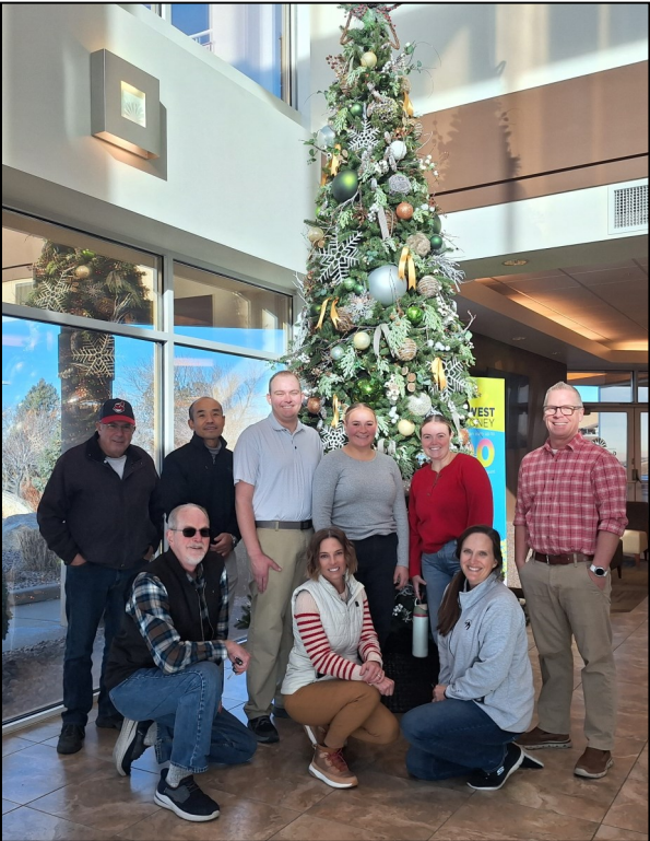
Volunteers from Goldenwest Credit Union, Weber Human Services, and Plain City Lions Club gather for a picture before heading back to the agency in Santa’s sleigh.